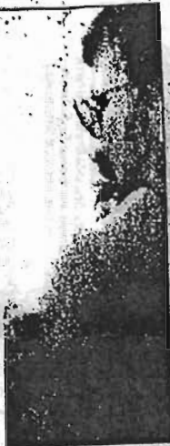
"I'm not worried about when they can't win on

Airport operations, more bad popped up. "I'm not sure why he chose to," said Mike Duggan, Wayne's deputy executive director, who have sincere objectives call and sit down and try to formed. People with political ves attack through the media," ricone said he wanted a meet- it couldn't be arranged.